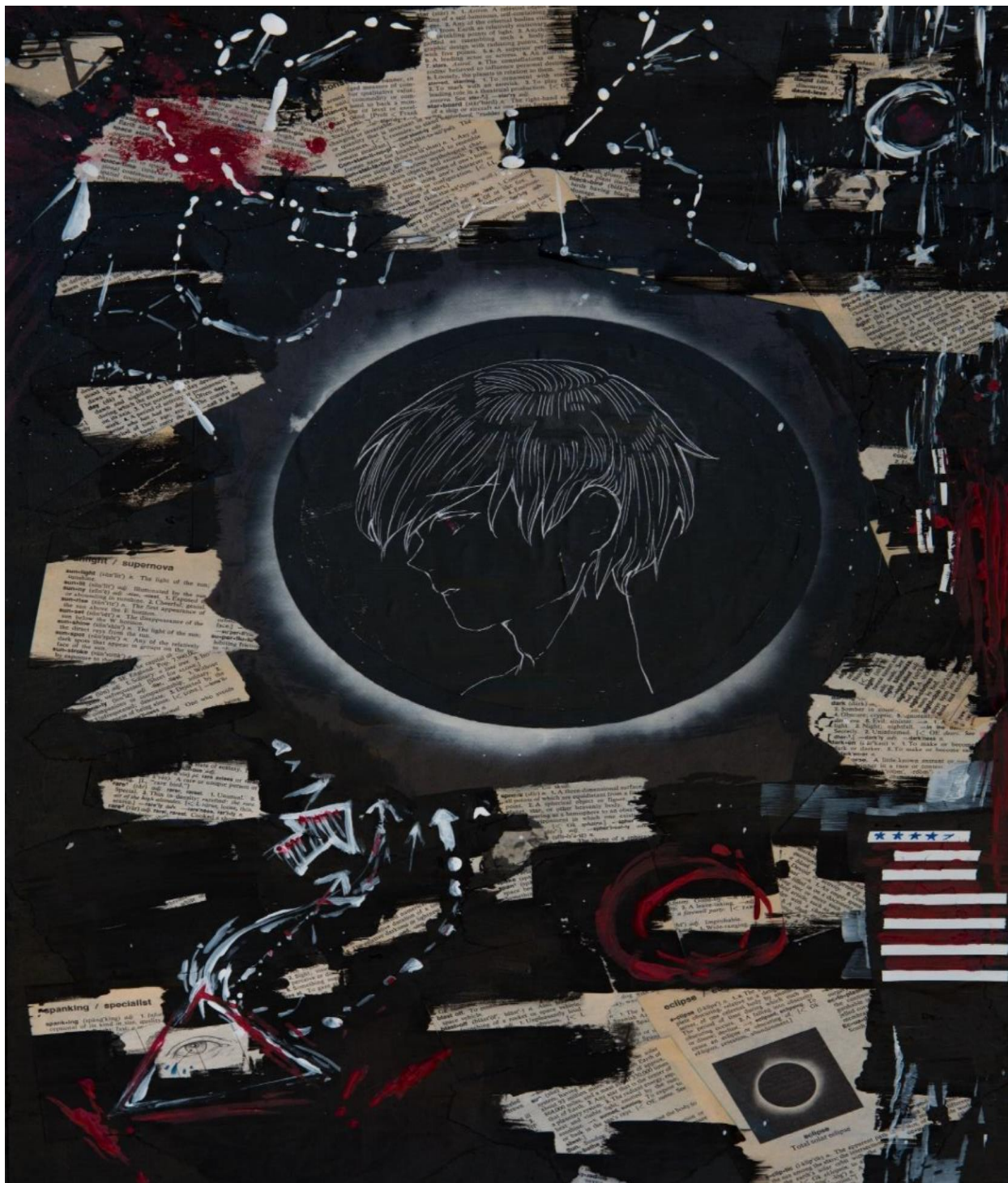
Pollux Mixed Media

I have always been intrigued by the perplexities of conspiracy theory, for instance, on subjects of such stature as space exploration. The deliberate red lines and torn scraps from books imitates the classic demented portrayal of a conspiracy theorist's mind. I intended to create a mood of isolation and inexplicable alarm.